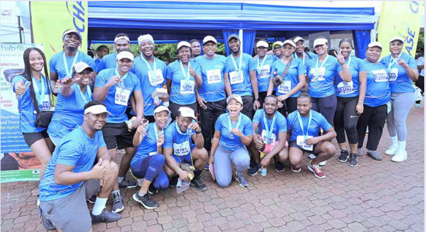
Some members of the CHASE team pose for a post-race photo at the Blue Run.

Financial assistance was provided to support the Church of God of Prophecy’s 10th Annual Community Health Fair, held on August 10, 2024, on Nugent Street. The event intended to promote healthy living, offered screenings such as eye exams, cholesterol tests, haemoglobin checks, microalbumin tests, and Doppler ultrasound scans. Approximately 70 individuals benefited from the fair.