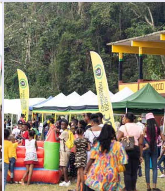
A scene from the Christiana Independence Gala