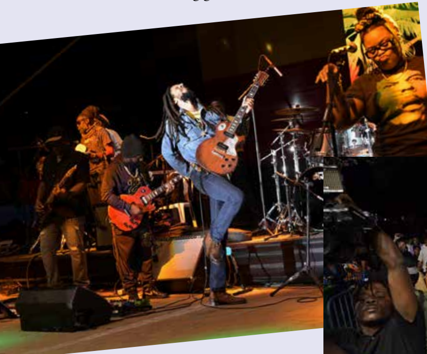
Skip Marley, grandson of Bob Marley, performs at the tribute concert on February 6, 2025

Hurricane Beryl struck Jamaica on July 3, 2024, causing widespread devastation across the island. In response, CHASE approved funding across its key sectors—Arts and Culture, Health, and Early Childhood Education—to support recovery efforts. Within the Arts and Culture sector, the Jamaica National Heritage Trust (JNHT) received funding to carry out rehabilitation work at the Seville Heritage Site.