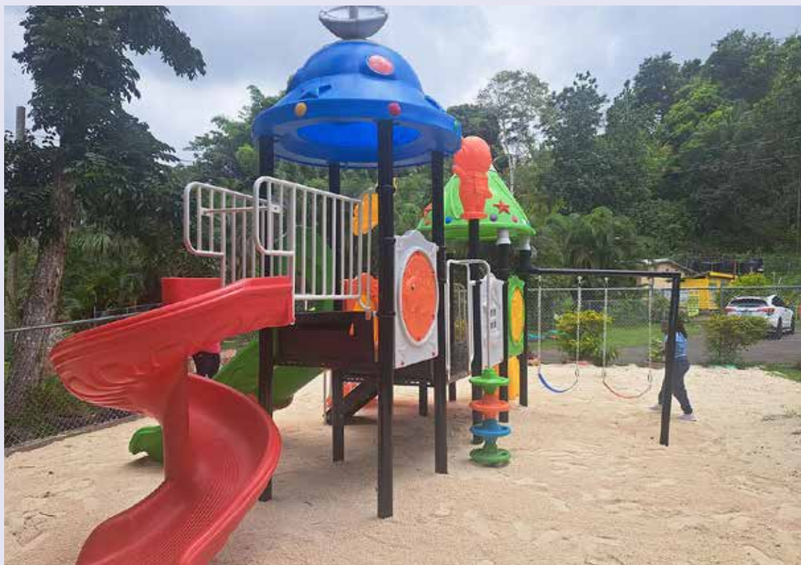
Play area at Maryland Primary and Infant School in Maryland District, Hanover

Maryland Primary and Infant School, located in Hanover, is certified by the Early Childhood Commission (ECC). To help maintain this certification, the school received financial support from CHASE to enhance its play area by supplying and installing a suitable playground surface, making the environment more child-friendly.