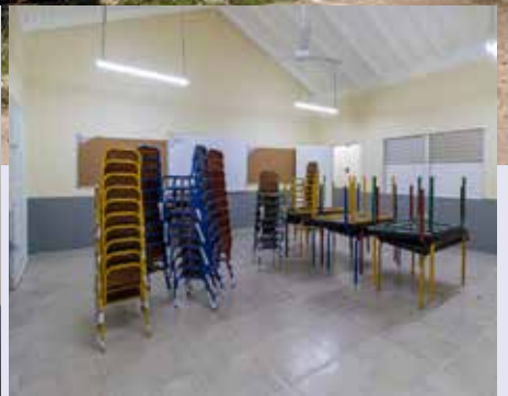
Photos showcasing the exterior and interior of the newly constructed Farm Primary and Infant School.