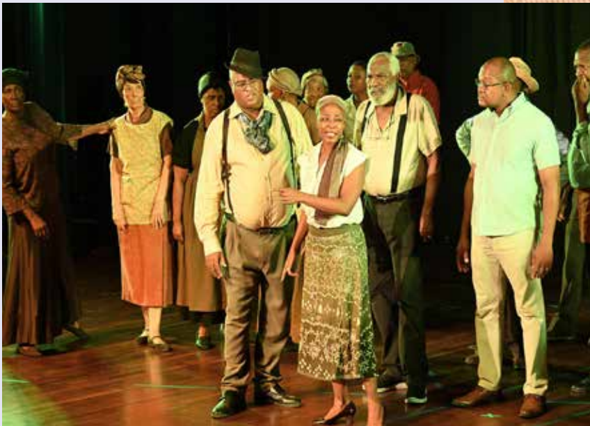
Porgy and Bess Opera