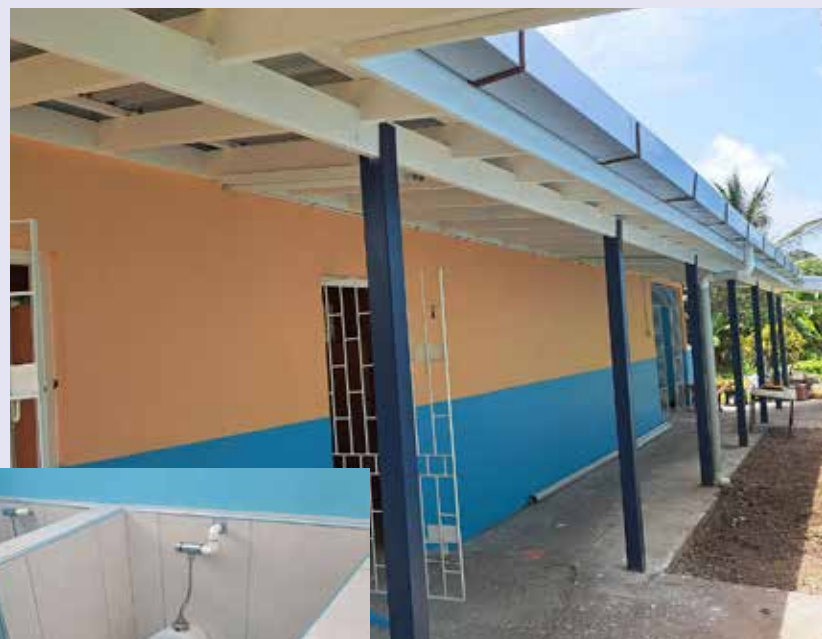
Exterior and bathroom photos of Alley Infant School in Clarendon

In May 2023, funding of $9.46 million was approved for the renovation of the existing infant school building and bathroom facilities. The project included the construction of a linkway to connect the classrooms to the bathroom facilities, providing improved access for infants, teachers, and auxiliary staff. An additional $2.3 million was approved in the 2024-2025 financial year to erect a perimeter fence at the institution.