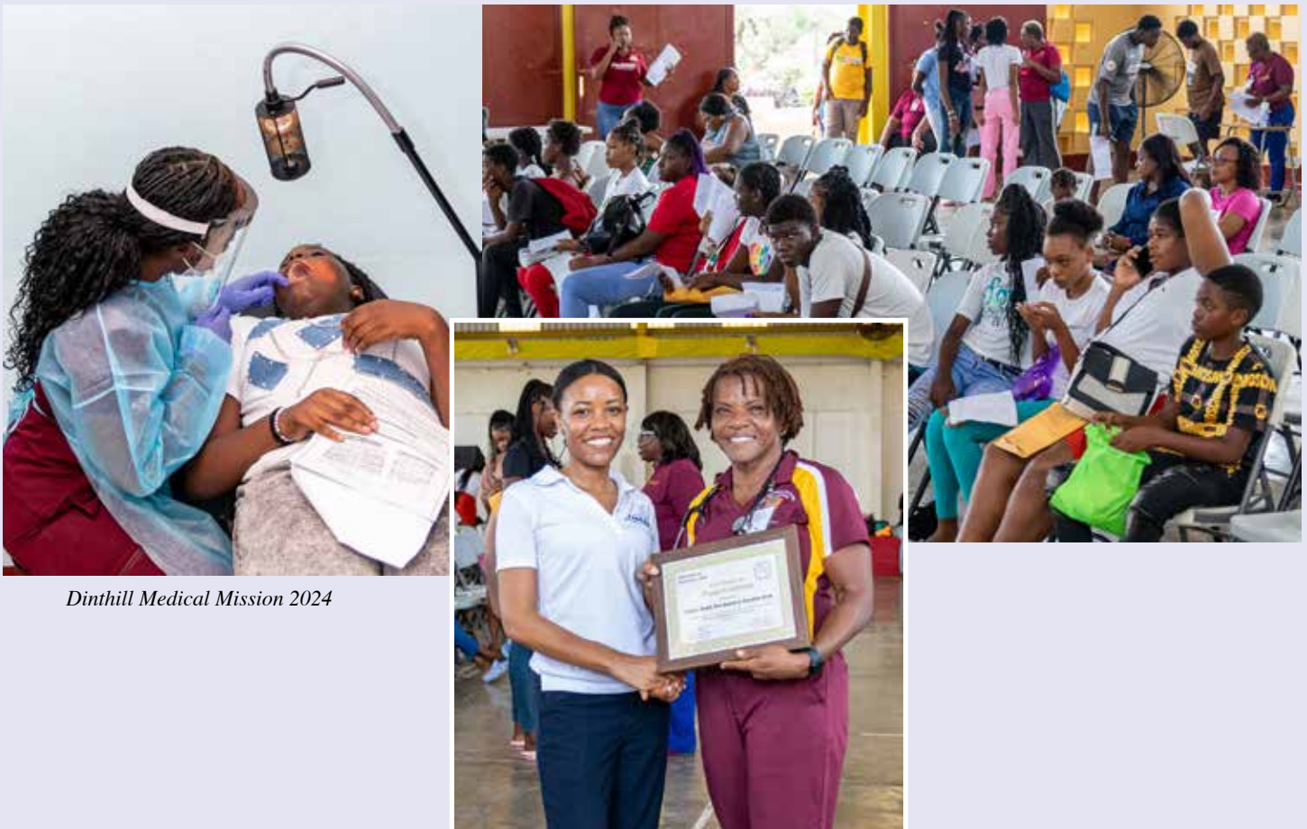
Dinthill Medical Mission 2024

The Good Samaritan 5K Run/Walk received sponsorship for its August 2023 event attracted 3,000 participants. The primary goals were to raise funds for the purchase of a dialysis machine for Andrews Memorial Hospital and to support the ongoing work of the Good Samaritan Inn.