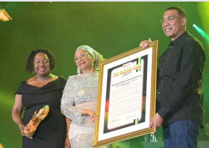
Prime Minister Dr. the Most Hon. Andrew Holness and Hon. Olivia “Babsy” Grange, Minister of Culture, Gender, Entertainment and Sport, present Jamaican music icon Marcia Griffiths with the Lifetime Achievement Award during the Reggae Gold Awards.

Reggae Month Red Carpet - Launch of Three (3) Films $6,000,000 The Ministry of Culture, Gender, Entertainment and Sport received support for a series of film premieres during Reggae Month in February 2025. The films and their premiere dates were as follows: i. Love After Holidays-February 7, 2025, at Carib 5; ii. Romeo and Juliet 4EVA - February 18, 2025, at Carib 5; and iii. Sugar Dumplin-February 23, 2025, at the Sunken Gardens in Hope Botanical Gardens.