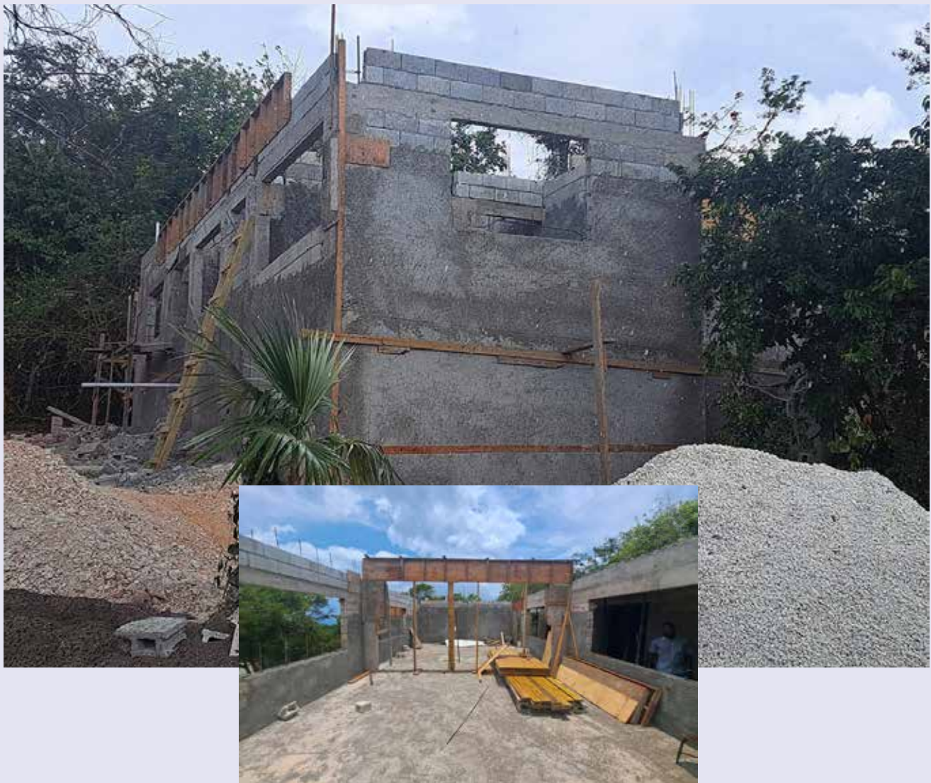
Renovation in progress at Marlie Hill Primary and Infant School in Manchester.

Building Infant Schools and Resource Centres Sub-total: $48,462,575