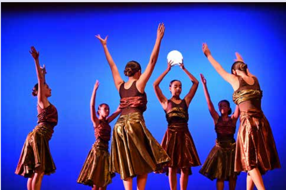
Festival of the Performing Arts

“Sounds of the Season” is an annual Christmas concert presented by the Young Jamaica Ensemble Community Music Project of Sam Sharpe Teachers’ College. Since its inception in 2004, the event has become a cherished tradition on the College’s calendar, delivering a high-quality entertainment experience for the College community and surrounding areas. Support was provided for the 2024 staging of the concert, which took place at Iberostar Rose Hall on December 15, 2024.