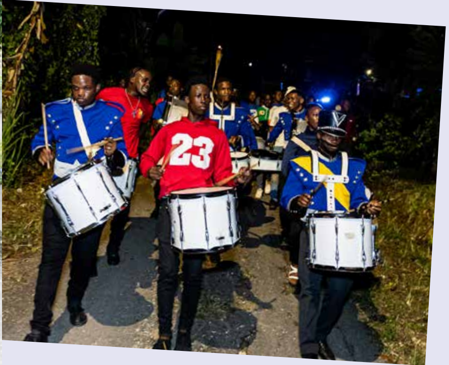
Students participate in the Flames of Freedom Torch Run on December 27, 2024.