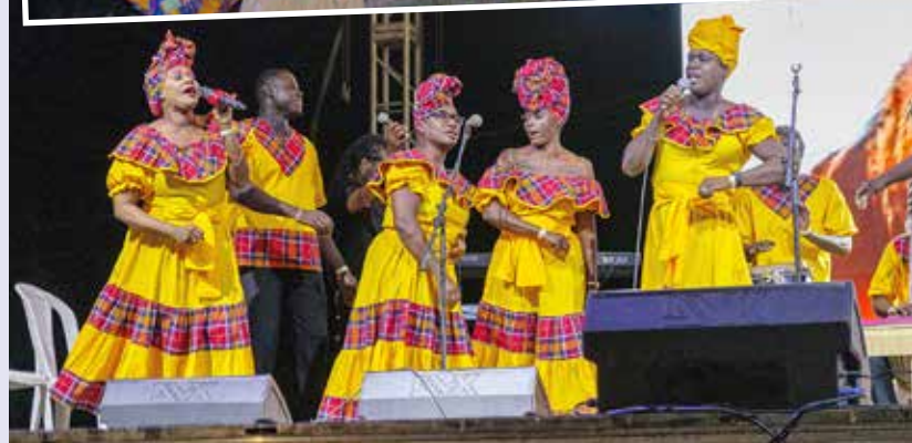
Highlights from the 2024 Seville Emancipation Jubilee.

The Jamaica National Heritage Trust (JNHT) is a statutory organization with extensive responsibilities, including the planning and execution of heritage education programmes in schools and communities, as well as providing the public with information about Jamaica’s material cultural heritage. Its flagship national event, the Seville Emancipation Jubilee, plays a vital role in fulfilling its public education mandate and is a prominent feature on Jamaica’s annual “Emancipence” celebrations calendar. Held from July 31st through “August Mawnin” each year, the event draws thousands of Jamaicans and visitors who enjoy live cultural performances and traditional Jamaican cuisine, including the famed all-you-can-drink ‘Chocolate Tea’ served in enamel mugs. The festival also offers reflective moments on