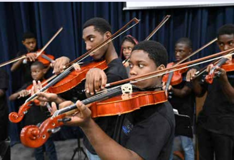
Violin class: JDF Summer Music Camp 2024

The third staging of the Jamaica Defence Force’s (JDF’s) music summer camp targeting inner city youth was held during July 2024. Forty (40) at-risk youth (up from 25 in 2023) were exposed to the playing of orchestral and pop band instruments and vocal training and benefited from motivational and team building sessions delivered by JDF personnel. The camp culminated with a concert presentation to sponsors/stakeholders including JDF members, community members, and family. Support was approved to help offset the cost of the initiative.