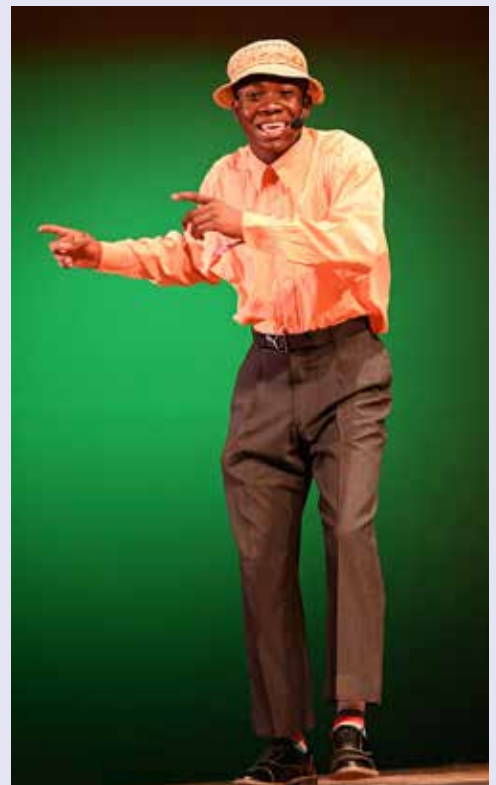
Festival of the Performing Arts