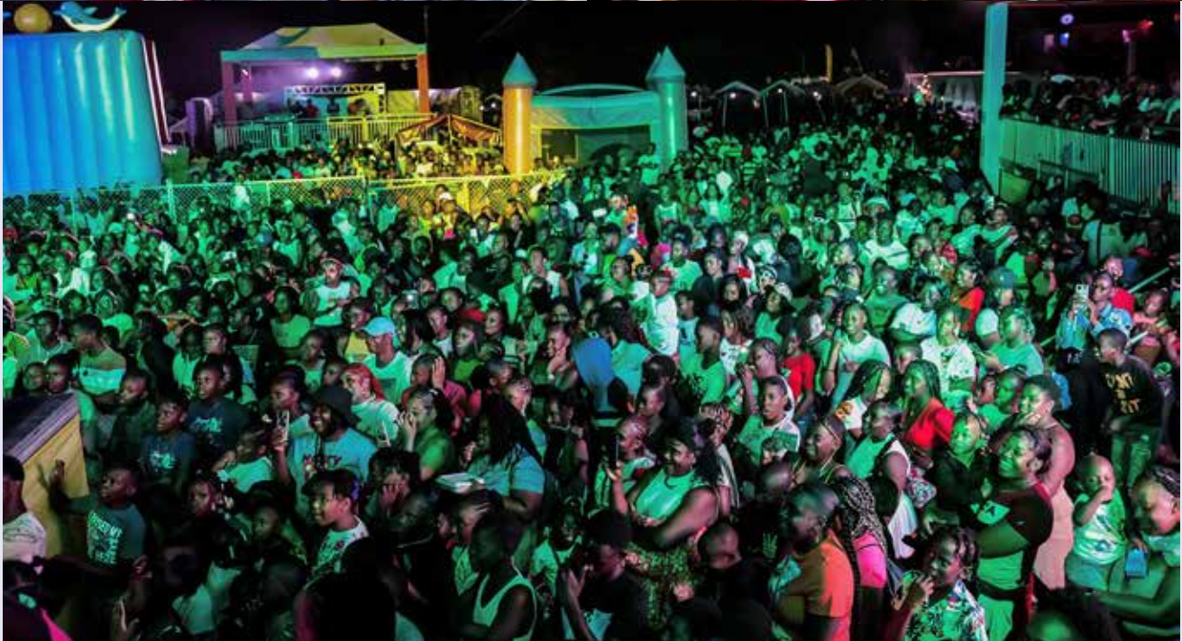
Guests revel in the day and night festivities of the St. D’Acre Carnival Extravaganza.