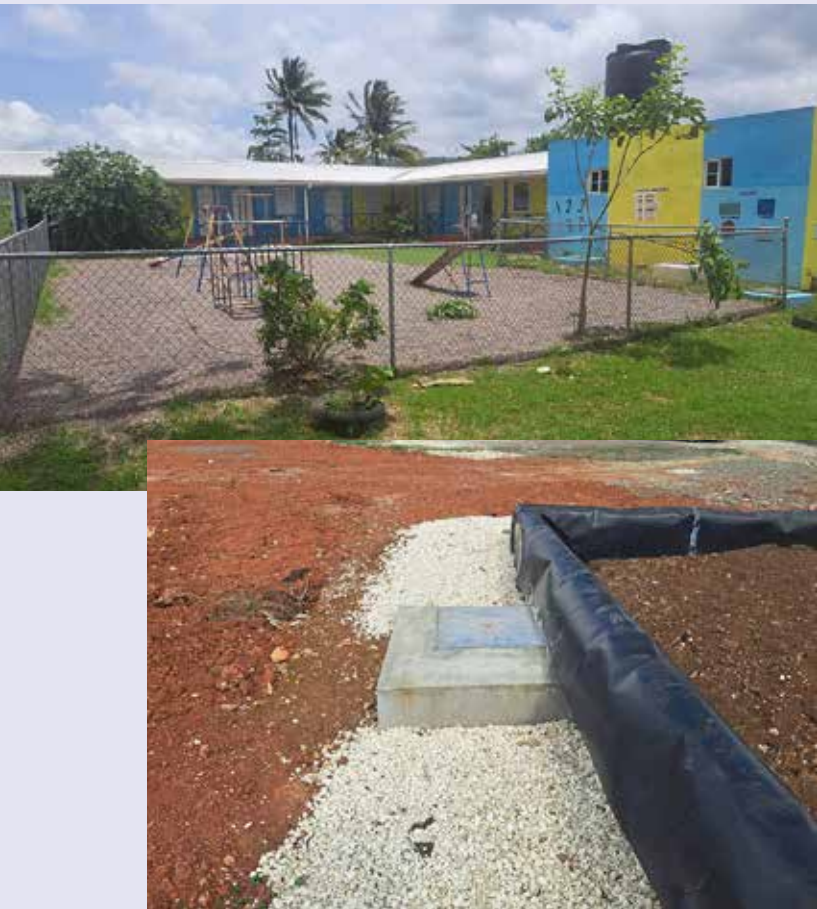
Fencing and renovation to the sewage treatment system at St. Michael’s Primary and infant School was achieved in 2024.

St. Michael’s Primary and Infant School was originally established in 1986 as a basic school in the St. Michael’s Anglican Church Hall. In September 2020, it gained infant status and became a government-owned and operated institution under the Ministry of Education, Skills, Youth and Information’s Rationalization Programme. Renovations to the school’s sewage treatment system and fencing of the area were made possible through funding from CHASE.